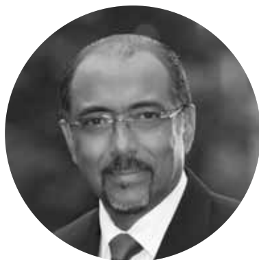
Michel Sidibé Executive director, UNAIDS