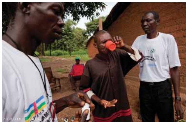
PHOTOS: MECTIZAN DONATION PROGRAM Mectizan distribution, Gbatong, Central African Republic