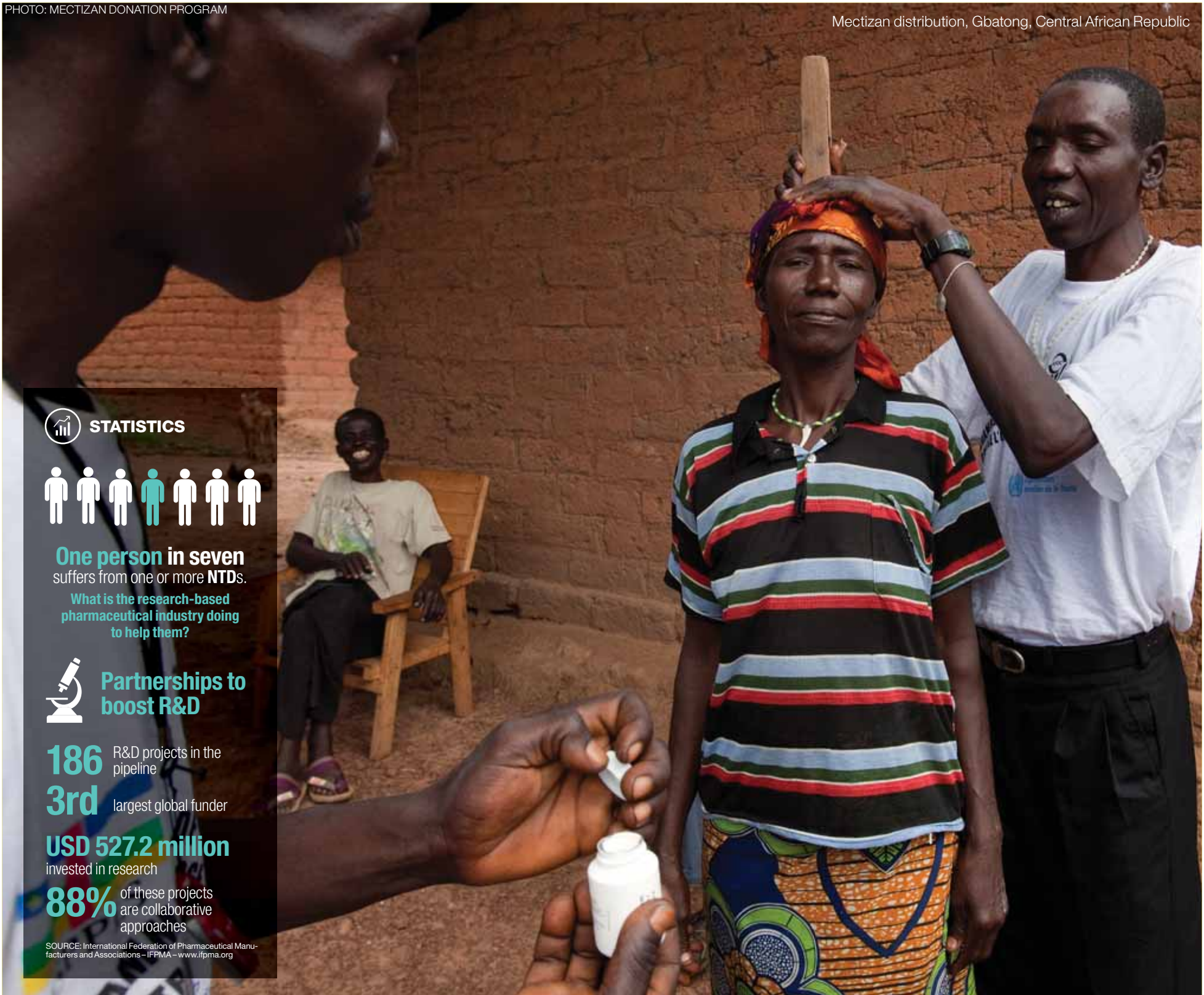
Mectizan distribution, Gbatong, Central African Republic